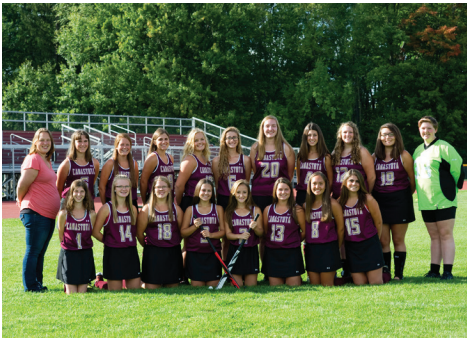
Varsity Field Hockey