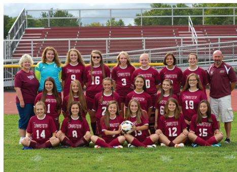
Varsity Girls Soccer