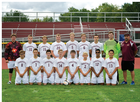
Varsity Boys Soccer